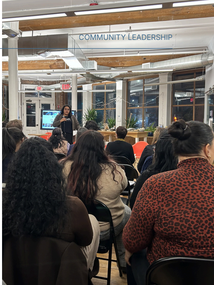
Mental Health Policy Circle, 2025

Across tertulias, forums, and policy circles, LPI continues to ensure that its research is not only informed by community voice but also shared back in ways that build understanding, connection, and collective action.