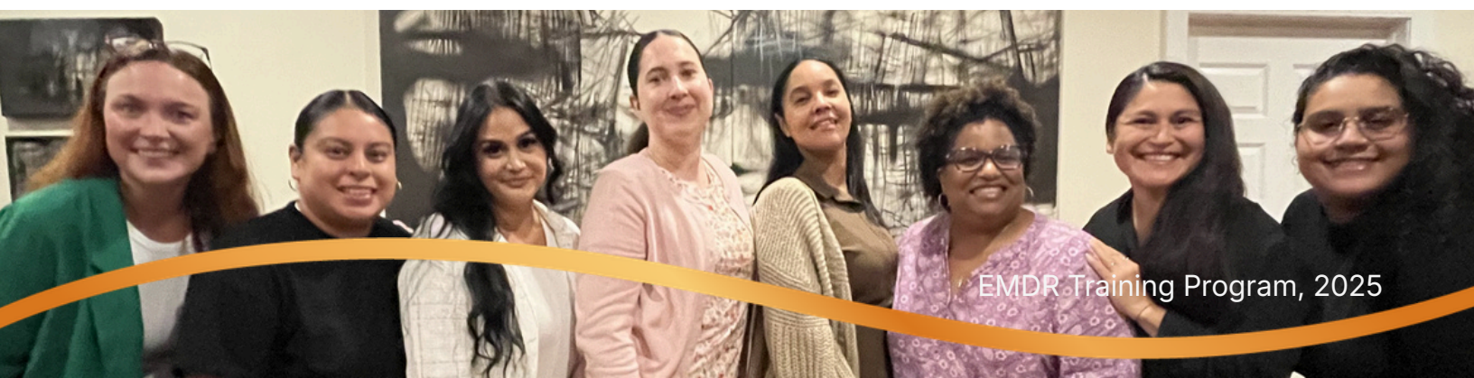
EMDR Training Program, 2025